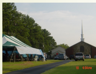
Carolina Baptist Church Spartanburg, SC